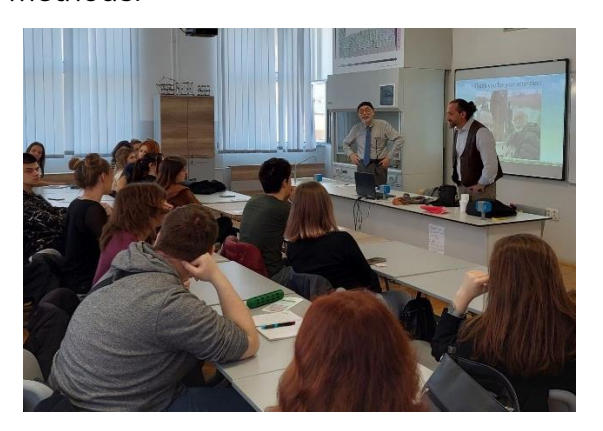
Discussion about PFAS chemicals in Fifth Belgrade gymnasium

Members of PFAStwin have presented the project within 1st Training workshop in the framework of TwiNSol-CECs project. The aim of this event was to gather scientists and experts interested in problems of CECs' (contaminants of emerging concern) environmental occurrence and relevant analytical methods.