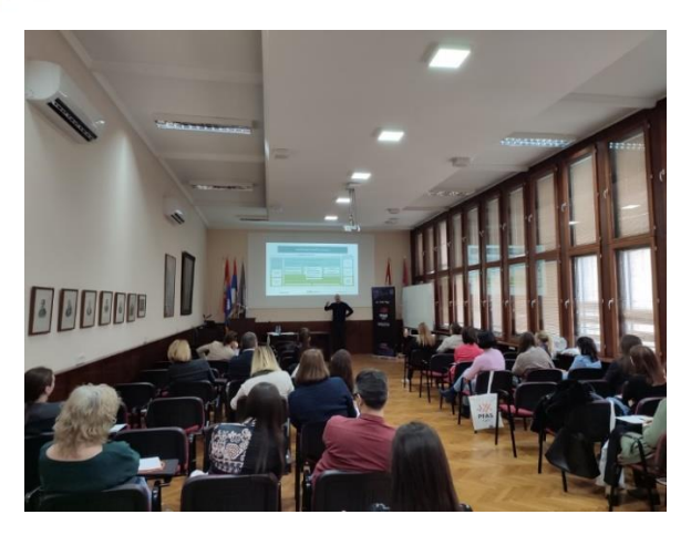
Hands on seminar on Proposal Preparation and Writing at UBFC