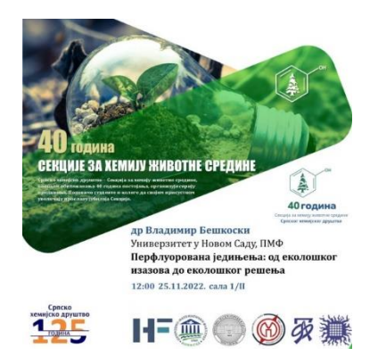
PFAStwin promotion on the 40<sup>th</sup> anniversary of the Environmental Chemistry Section of the Serbian Chemical Society

Members of PFAStwin have presented the project within 1st Training workshop in the framework of TwiNSol-CECs project. The aim of this event was to gather scientists and experts interested in problems of CECs' (contaminants of emerging concern) environmental occurrence and relevant analytical methods.