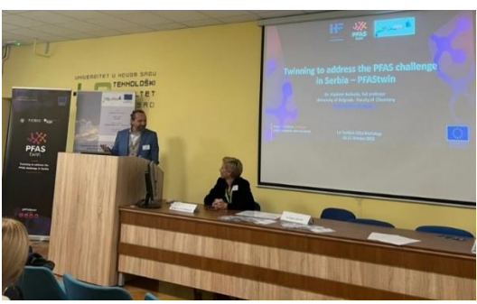
Promotional lecture at the University of Novi Sad in Serbia

Together with academics from Japan who visited Serbia in the frame of more than ten years of collaboration, the PI of the PFAStwin project discussed perand polyfluorinated compounds with a selected group of high school students gifted for chemistry and biology in Fifth Belgrade gymnasium.